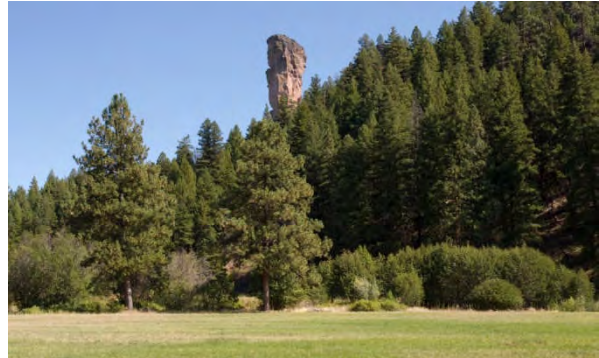
Stein's Pillar, fields, and Mill Creek.

agricultural and forestry practices; and preserving important ecological values, including migration corridors, priority habitat, water quantity and quality, and sensitive, threatened and endangered species.