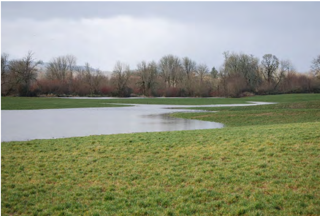
Willamette River floodplain near Albany: farming on a property that contains a conservation easement.

In order to meet OWEB's constitutional mandate in the future, especially in light of long-term climate change, it is recommended that OWEB establish priorities based on an ecosystem and landscape approach to watershed health, focusing on biodiversity, watershed processes and functions, and ecosystem resilience and adaptability. With this focus, and with much of Oregon's privately owned land in farming, ranching and forestry, it will be increasingly important for OWEB to provide grants for protection and restoration projects on these lands. Conservation easements will be an important tool to help accomplish this.