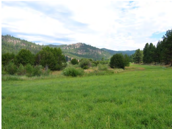
Balancing farm use and riparian health at Aspen View Ranch, Mill Creek.

Staffing levels of the state programs varied considerably, depending primarily on the frequency of grant cycles (ranging from biennial to twice annually) and the role of staff in board support, policy setting, rulemaking, project evaluation, grant administration, monitoring, and addressing legal disputes (including litigation). Maryland's Agricultural Land Preservation Program—the oldest program evaluated—had the largest staff (seven plus assistance from other agencies) and Washington's Farmland Preservation Program—the newest program—the smallest (0.5 FTE).