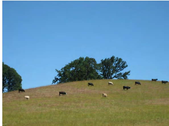
Rotational grazing is used to help maintain oak savanna and upland prairie habitats on a property near Wren that contains a conservation easement.

Oregon also receives funding from the Grassland Reserve Program, a Farm Bill program administered by NRCS and the Farm Service Agency. However, by policy of the state office, funds are used only for rental contracts, not easement acquisition. In addition to preserving grassland, specific conservation values, such as sage-steppe protection, are targeted in each funding round.