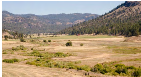
The 492 acre Coffey Ranch, east of Prineville.

The state easement funding programs reviewed (Colorado, Maryland and Washington) all provide grants for acquiring conservation easements on working land. Colorado's Open Space Program (funded by the lottery) is targeted primarily at preserving open space and important ecological values but recognizes the importance of working land in achieving these goals. The Maryland Agricultural Land Preservation Foundation (funded by a real estate transfer tax) is focused primarily on preservation of farm and forest land but has ancillary environmental goals. Washington's Farmland Preservation Program (funded by tax exempt general obligation bonds) is intended primarily to preserve farmland but can include funds for protection and restoration of ecological resources. Washington's Salmon Recovery program (also funded by bonds) targets restoration and protection of salmon habitat, sometimes on working land. Acquisitions are