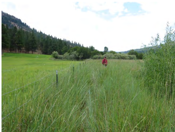
Buffer between agricultural field and Mill Creek, Aspen View Ranch.

The Farm and Ranchland Protection Program is a Farm Bill program administered by the Natural Resources Conservation Services (NRCS), providing grants to local entities to acquire conservation easements. The Oregon NRCS office provides a full-time liaison to state and local conservation programs, which has led to better communication and more flexibility than programs in the other states evaluated. Grants have been used to match OWEB grants for working land conservation easement acquisitions. Oregon ranks 13th in the country for total acres (16,000) enrolled in the program.